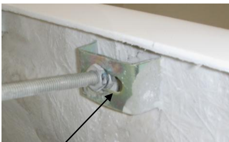
Metal fixing hole